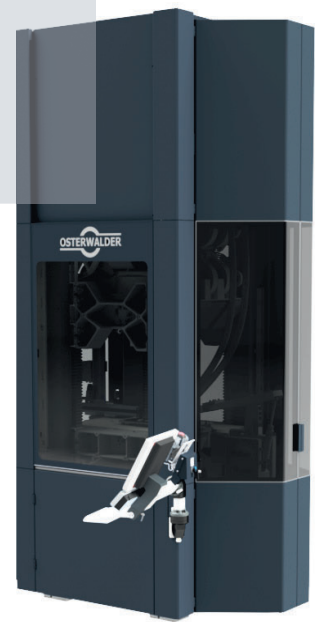
SP 2000 with compact design