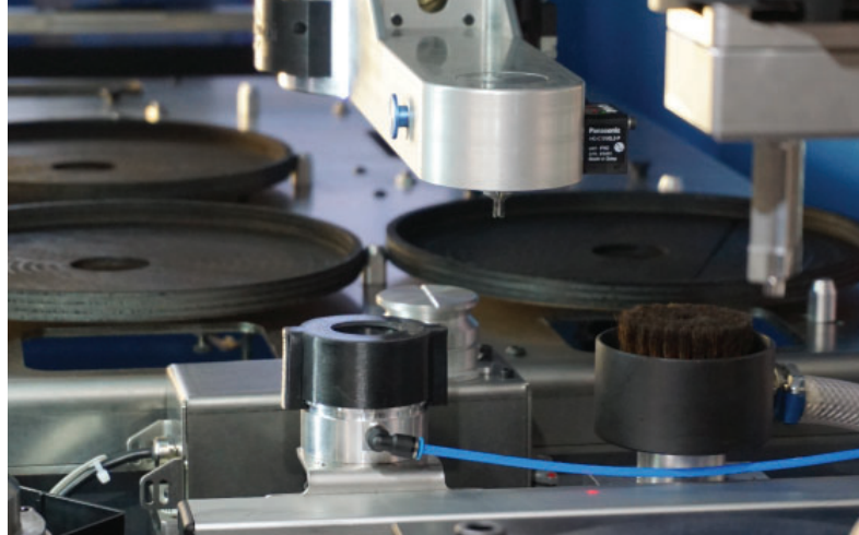
Part deburring - Airclean cyclone- Scale